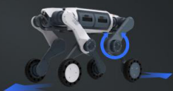
Reversible Direction, U-turns in Narrow Spaces Without Turning Around

Parameters are based on official test data; actual performance may vary in real-world conditions.